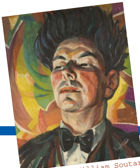
Portrait of William Soutar