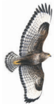
Buzzard Buteo buteo