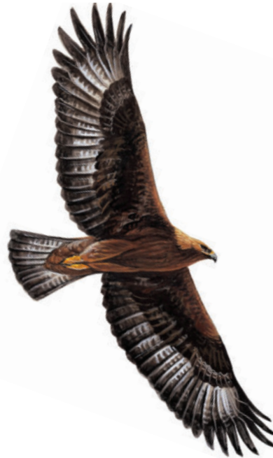
Golden Eagle Aquila chrysaetos