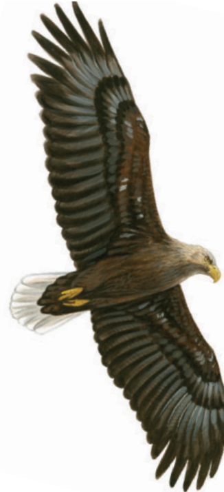
White-tailed Eagle Haliaeetus albicilla