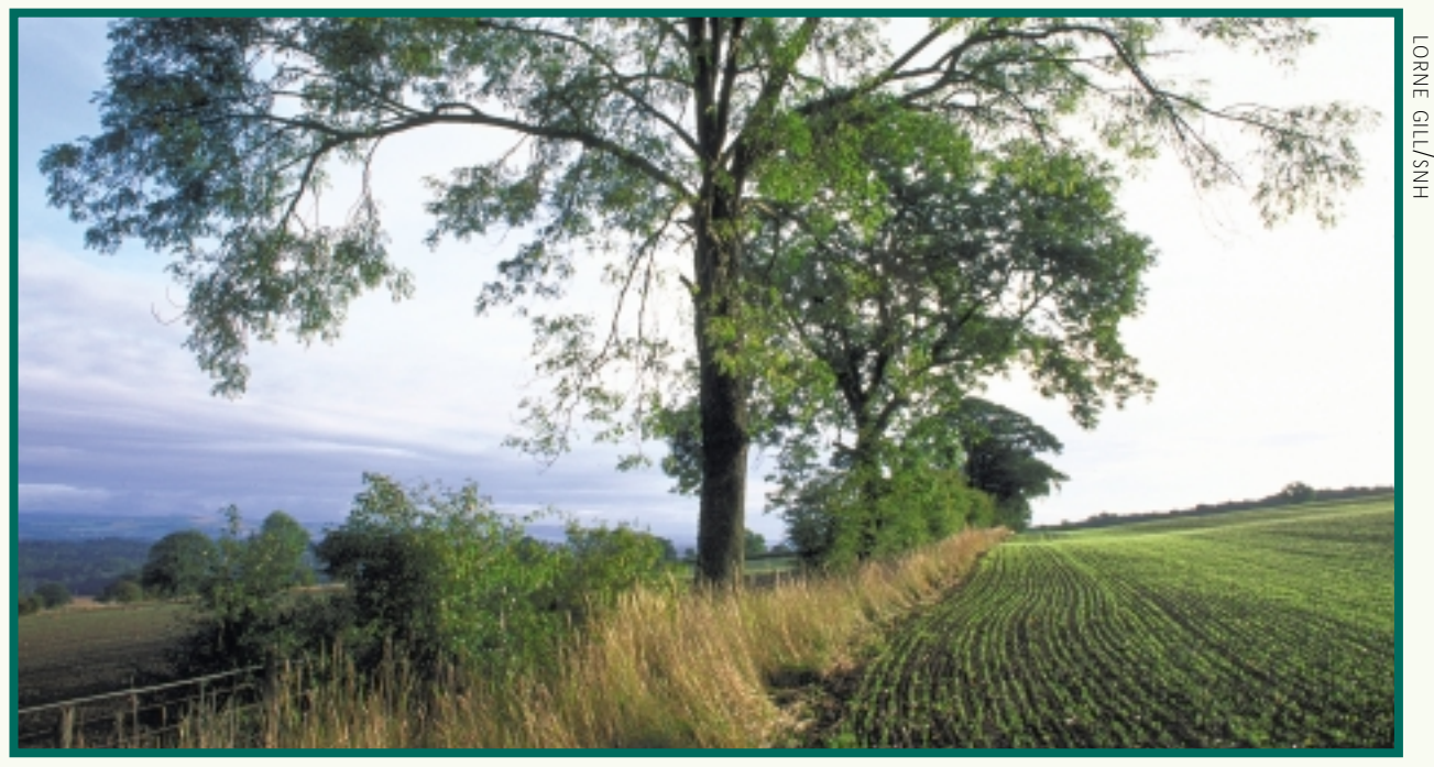
NEAR CARGILL, PERTHSHIRE