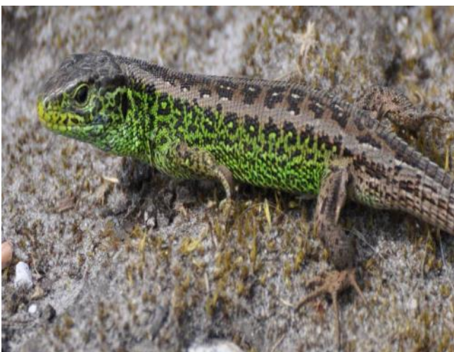
Sand lizard

The project, entitled Community Engagement in Amphibian and Reptile Conservation across Wales , aims to encourage a sense of ownership and responsibility for Welsh biodiversity and provide opportunities for people to engage with amphibians and reptiles as part of the shared natural heritage of Wales.