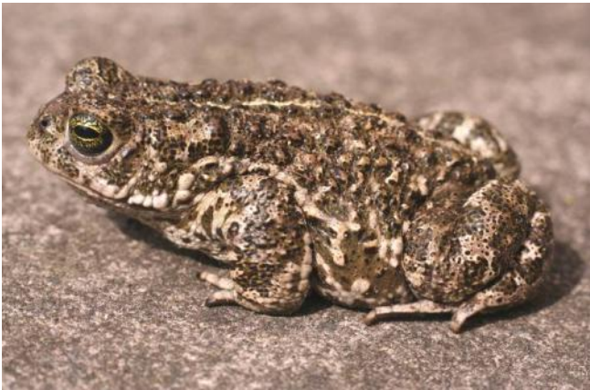
Adult natterjack toad

If the distribution of the natterjack in Scotland is to be maintained, a great deal of effort is required to ensure suitable habitat is available. Local volunteers have continued to provide valuable information, in addition to survey work by ARC. Landowners should be able to apply for funding to manage habitat for natterjacks under the Scottish Rural Development Programme (SRDP). ARC hopes to secure more funding for natterjack conservation and build on the work completed during 2012, which was funded in partnership with Scottish Natural Heritage (SNH).