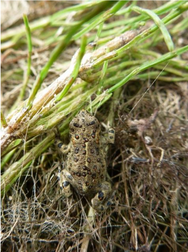
Natterjack toadlet

Looking to the future we think that the terrestrial habitat is key and we are reviewing the possibility of introducing a few Dartmoor sheep onto the dune systems to take the vegetation down.