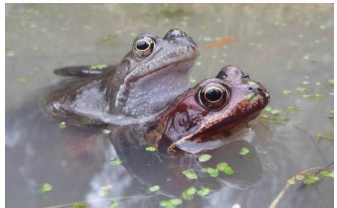
Common frogs breeding in a Welsh pond