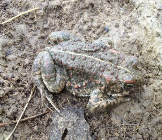
Adult natterjack toad