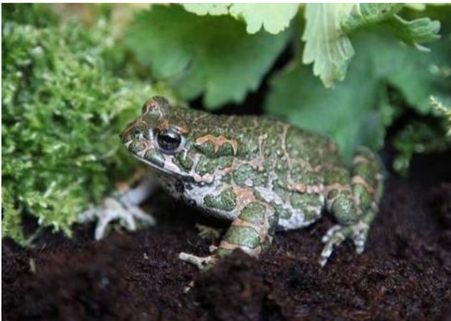
Green Toad ( Bufo [ Pseudepidalea ] viridis )

After describing the animal to me I asked if I could take a look and the caller kindly agreed to drive across Bristol to drop the amphibian off. The description sounded like a green toad but the caller assured me it was a frog and that it was quite happy in a bowl of water.