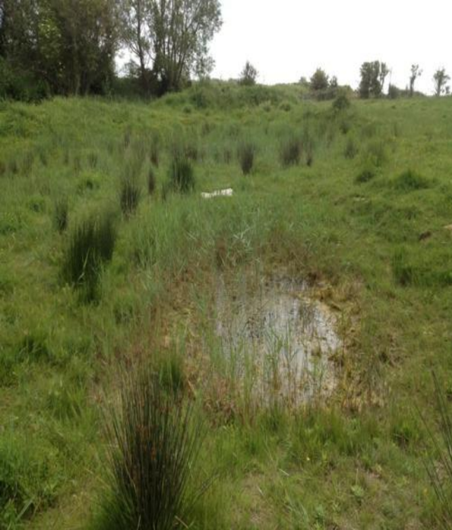
Natterjack pool in Kent