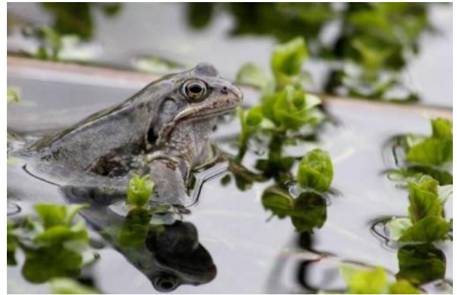
Common frogs

A circular to CRAG contacts drew a number of interesting comments on this. The general view was that while all common lizards are born black, relatively few retain this colour into adulthood like this specimen. The black colouring is thought to give young lizards a thermoregulatory advantage, but with increasing size the need for camouflage becomes more important. The proportion of melanistic individuals varies greatly between populations and may be affected by factors including the intensity of predation and the nature of the habitat.