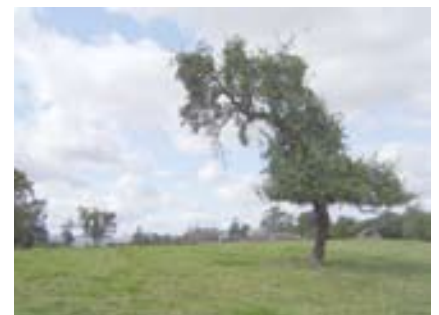
The few remnants looking from the south of the orchard at Bogmiln

Owner stated that not really interested in doing much with orchard.