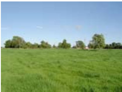
West orchard is now rather open, but contains some lovely specimens

The orchards at Templehall near Monorgan, have variously been known as Templehall or Monorgan in the historical record. It appears that the name may be used interchangeably. The place is reputed to have a long history associated with a rest place for monks on their passage to the river.