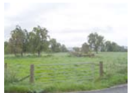
Grange is large and nowadays open