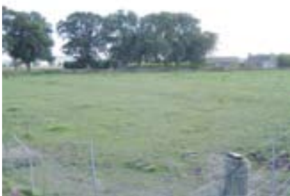
A plum orchard formerly occupied the whole of the field across to steading.

The landowner said his family was 5th generation at Rawes Farm. Prior to 1919 they had farmed at a neighbouring farm further west from Rawes. There used to be apples, pears and plums at Rawes. They were all old trees and were in the small field to the east of the house. Around 20 trees were there, though they had all been lost from old age about 15 - 20 yrs ago. He said his grandfather had told him that the whole field to the north east of the house, right up to the road used to be plums.