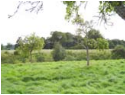
Port Allen Orchard used to extent into field the far side fo the burn

down to the burn at the field margin. The orchard in the east area remains in good stead.