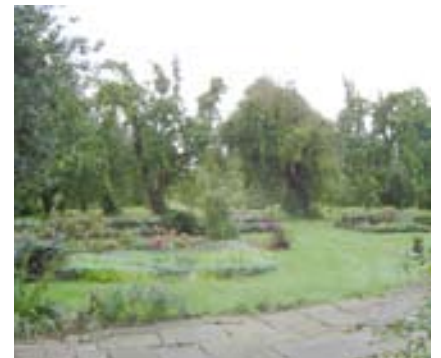
Much of Carse Grange Orchards now in the garden of The Retreat, and are in good condition

Mainly mature apple and plum trees remain.