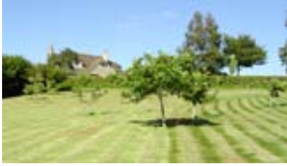
New plantings of old pear varieties on a small rootstock at Wayside