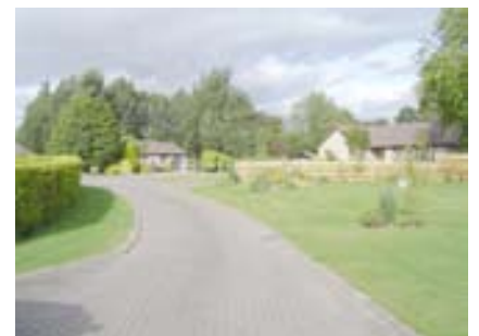
Part of Gourdiehill orchard site cleared for housing in 1989