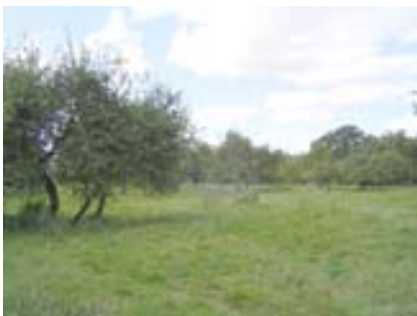
Flatfield still contains a good number of productive trees

Don't use much fruit because pears are sour. Pheasants love pears.