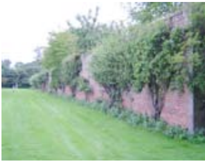
Old trees against wall on outside walled garden at Inchyra House

The orchard at Inchyra House is located at its walled garden, several hundred metres to the west of the House. Approximately 40 mature fruit trees feature both on the inside and outside of the wall. Twisted old plums are a feature outside the wall.