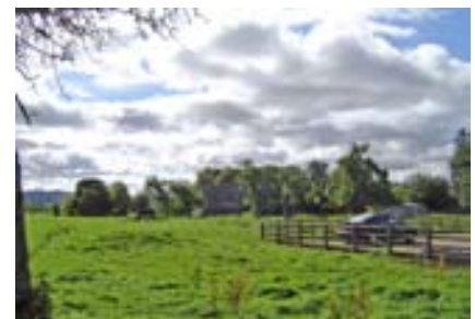
Large trees remain at Newbigging towards the doocot (above) and the odd remnant survives on the south side of Grange Pow (below)