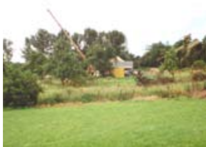
East orchard: under development in 1996 (above), some trees remain today (below).

Brief descriptions of each orchard are given below. Further details can be found on the database.