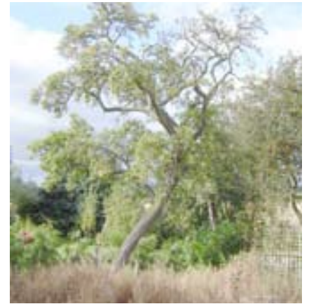
The last of ten thousand: a pear