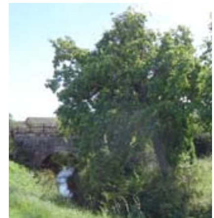
Clear lines of trees still exist at Port Allen (below)