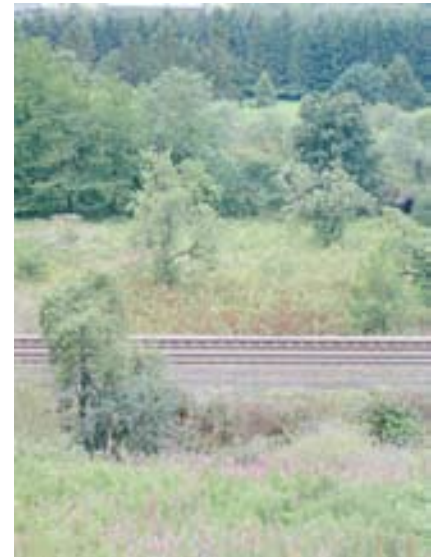
The orchard at Barnhill Toll mainly survives on the strip between the railway and the River Tay.

Apple trees lost by cattle removing bark. Owner said that old varieties had been collected by Mylnefield SCRI before this