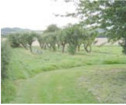
3 rows of apples remain at Clashbenny

At Clashbenny Farmhouse there remains a small orchard just to the south of the formal garden. It amounts to three rows of large mature apple trees. Survey notes: