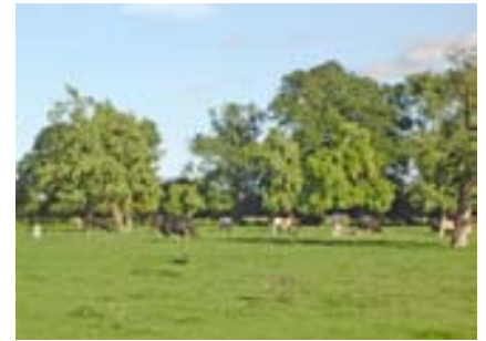
East orchard at Monorgan still has a good number of trees and is a lovely scene

Owner has no objections to journalists being invited (eg. Dundee Courier) to a wee photo shoot in the orchard to publicise this survey work.