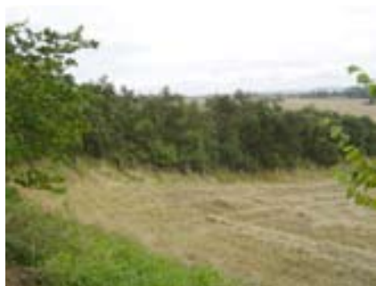
West orchard: from the exterior (above) and the abandoned interior (below)

Eastern orchard of Wester Ballindean: In 1996 this was an gappy orchard with a significant number of trees. Local information is that a planning application for a single storey house was granted. Subsequently the planning was amended to two large, two storey villas. The orchard owner (a development company) sold the plots to a builder. Around 15 mature fruit trees remain in the two gardens that comprise the eastern orchard.