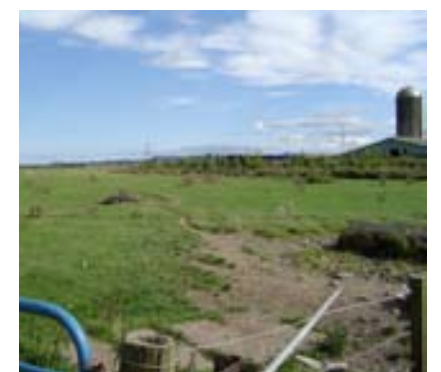
Looking down across former orchard site, partly lost to expansion of farm buildings