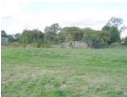
Orchard remains inside small old walled garden at Inchyra Farm. The orchard formerly covered the field in the foreground.

A small walled orchard remains at Inchyra Farm, on a scale suitable for household use. It is in an unkempt condition but features around 20 large and interesting old veteran apples and plum trees.