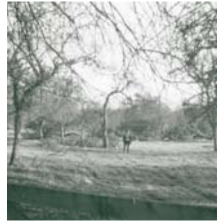
Pitfour in 1960 above; below the former keeper explains where the orchard was when her family had it.

A short interview with the correspondent was recorded on video, whilst over looking the former site of Pitfour Orchard.