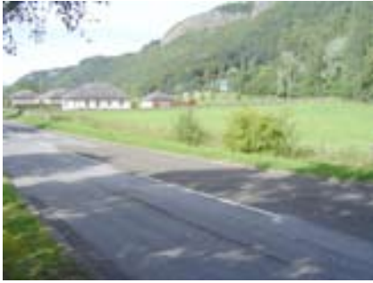
Western part of orchard now paddock and A90 (above). To the east end the last remnant - an apple by the railway (below)