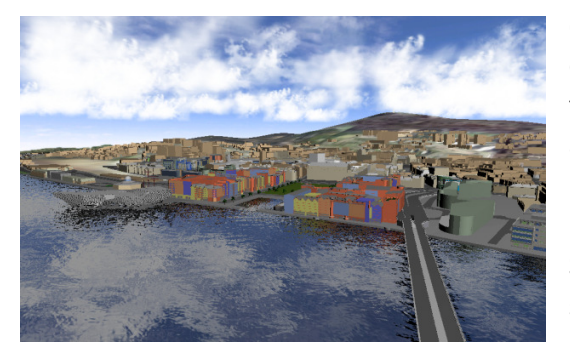
Dundee Waterfront

Turning Tides , a one day conference held at West Park Conference Centre in Dundee on Friday 19<sup>th</sup> April, by the TEF, looked at ways in which we are adapting to change at our coasts; specifically in light of future policy directions and