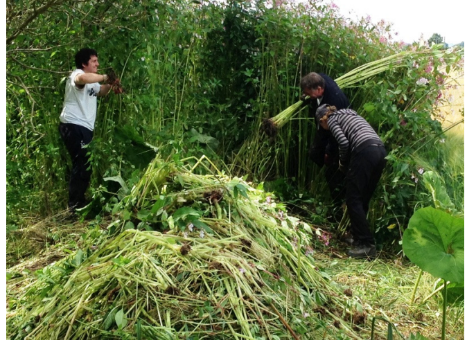
Treatment area at Bridge of Dun. Map & Images © A Cheshier