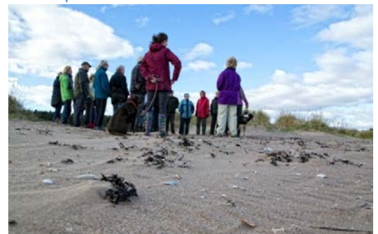
A captive audience at a guided walk in the dunes at "Between Tides" Tentsmuir NNR, Oct 2013