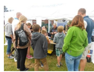
BioBlitz Activities