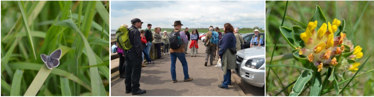
Small Blue butterfly; July 2014 Survey Training; Kidney Vetch

Balmashanner has Kidney vetch growing and is in an old quarry site, while the Dundee siting was on waste ground adjacent to a garden centre and a disused railway.