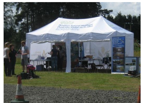
Photograph of Bioblitz Hub

We had a wealth of wildlife experts on hand to help participants get to grips with recording species - or just finding out more about what species can be found at the nature reserve. We had guided walks, displays, demonstrations and activities, including identifying bats, birds, insects and fish, tracking mammals and amphibians, and spotting alien species. Everything people see or find is written down to make a list of species records which then feeds into national databases that monitor our wildlife. One of the most popular events of the weekend was when Reserve staff and volunteers carried out bird ringing on Sunday morning! This was not even on the Bioblitz programme but as a scheduled monthly event it just happened to coincide with everyone being around.