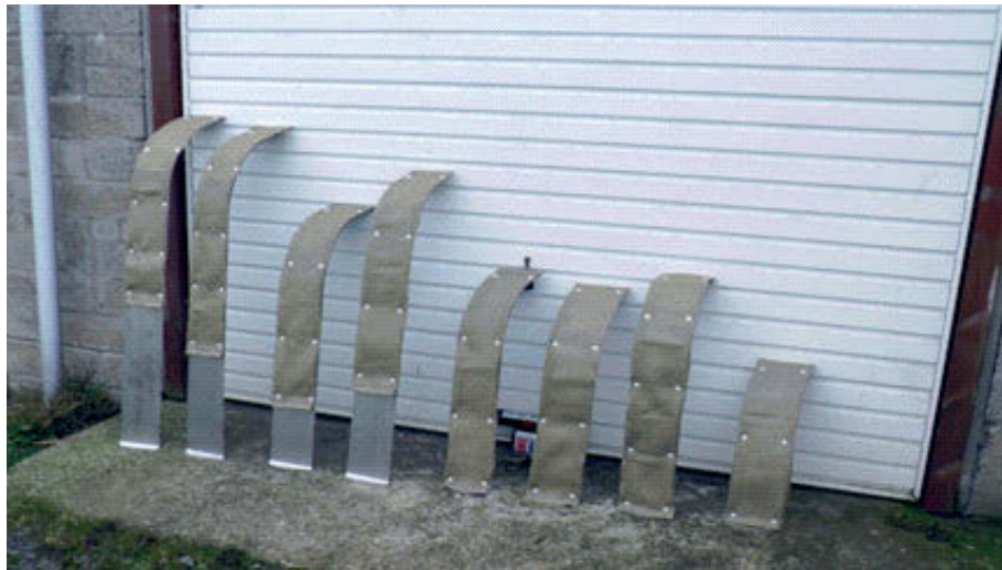
Amphibian ladder

The Roads Department gave permission for the first British Amphibian Ladder trial to be undertaken at two sites: one just north of Dundee (67 gullypots from which 252 live amphibians were released and a further 55 found dead in just one season's surveying) and the other in Carnoustie. This follows the first such trial in the Netherlands. The work is being undertaken by the Friends of Angus Herpetofauna and students from UHI and Dundee University. The volunteers gave an update of their findings at the Tayside Recorders' Forum event in Forfar in 2014 and were invited to give a similar update later in the year at the Amphibian & Reptile Conservation Scottish Symposium in Edinburgh.