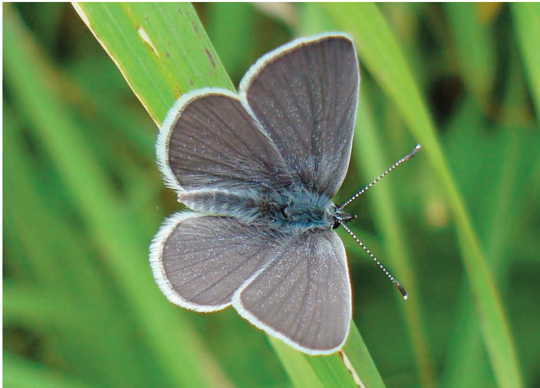
Small blue

The project now includes the North East Scotland Local Area Biodiversity Action Plan area as well as Tayside. The Interest Group was set up in 2011 and recently met at the end of September to report on the year's survey results and to plan the wider project in 2015. An MSc dissertation is guiding future work and there are hopes to develop longer term projects centred on coastal colonies and potential disused railway sites. Scotia Seeds will donate local provenance kidney vetch seeds to enable specific sites to be broadcast seeded. A local nursery will also grow on some of the seed for planting out as mature plants in early 2016. It is hoped this will help restore connectivity of populations along the coast.