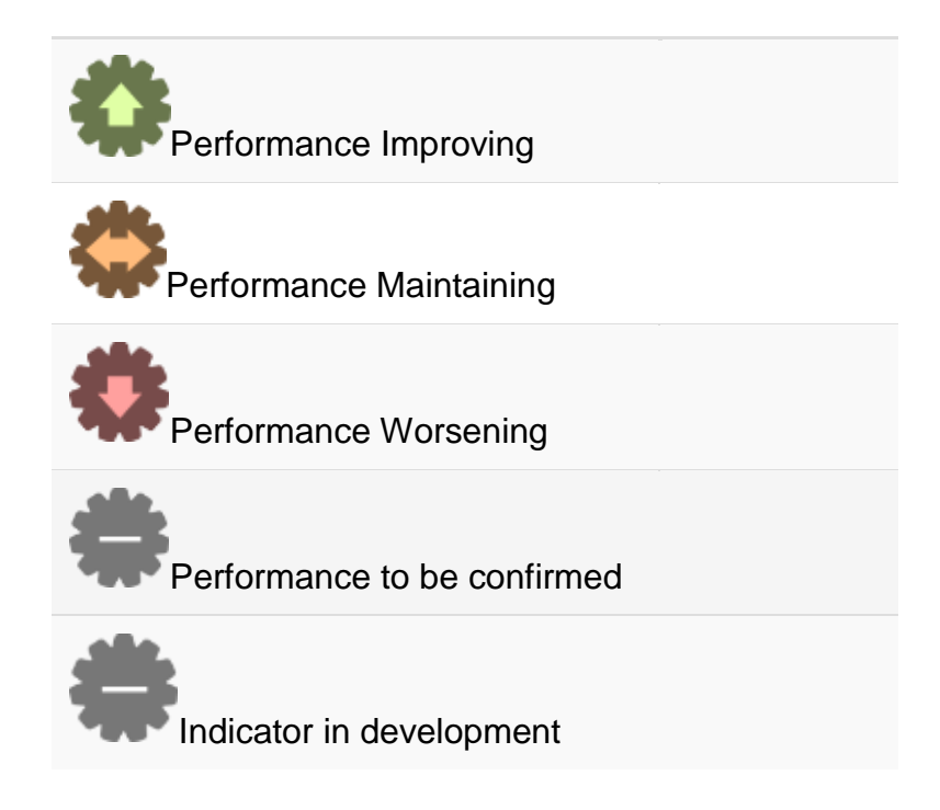
Table 9. Summary of Indicators.