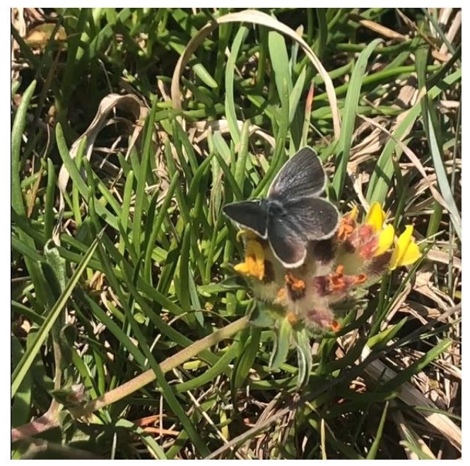
Image 1. SB on a KV, photograph taken in Seaton Cliffs 2021

The Kidney Vetch (KV) is a wildflower mostly found in coastal habitats<sup>2</sup>. As the sole caterpillar foodplant and site of oviposition for the Small Blue butterfly (SB), its presence constitutes a potential habitat for the endangered butterfly. Therefore, tracking it provides an approximation of the amount of habitat available for SB.