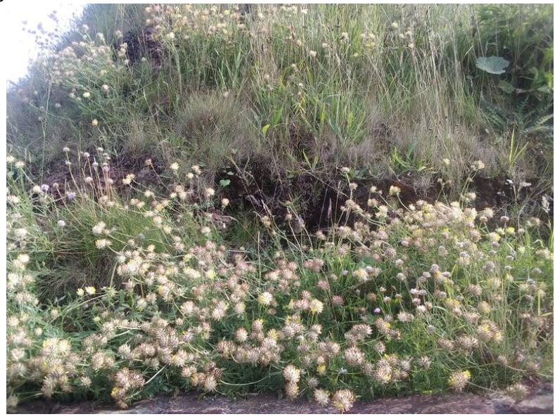
Image 2. Large numbers of KV planted by a volunteer at Lunan Bay, photograph taken 2021.

As seen in Table 2, there has been a fluctuation in the total number of KV throughout the years, with numbers increasing in Elliot Links from previous years, but decreasing from previous years in Arbroath, Lunan Bay, and between Boddin and Usan. This fluctuation was evaluated as significant (P<0.001) by a generalised linear model comparing the number of KV counted in each year (coefficients seen in appendix). While this is counter-intuitive due to the increase in volunteer planting sessions in recent years<sup>4</sup>, there are potential explanations for this decrease. It may be due to coastal erosion and rising sea levels making some locations inaccessible to surveying that were previously surveyed, and may also be because of the extensive late-spring frosts in April of 2021<sup>8</sup>. Additionally, plants may die due to varying soil conditions, animals such as rabbits digging up newly planted KV, or long dry periods affecting seedling.