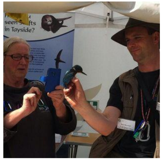
Wildlife recording in action – moths, rock pools, birds (kingfisher)