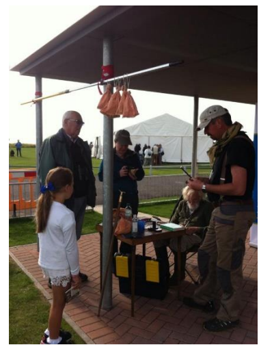
The East Haven BioBlitz

Any queries – Tayside Biodiversity Partnership: caglloyd@pkc.gov.uk www.taysidebiodiversity.co.uk ; Facebook – TaysideBiodiversity