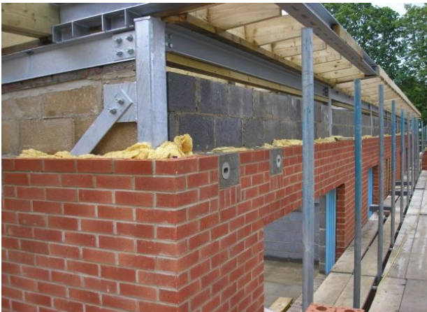
New Barnet, North London: Schwegler "Swift Bricks" installed in a sheltered housing project

Don't allow creepers or plants to encroach on the nest. They will hinder the Swifts and give access to predators.