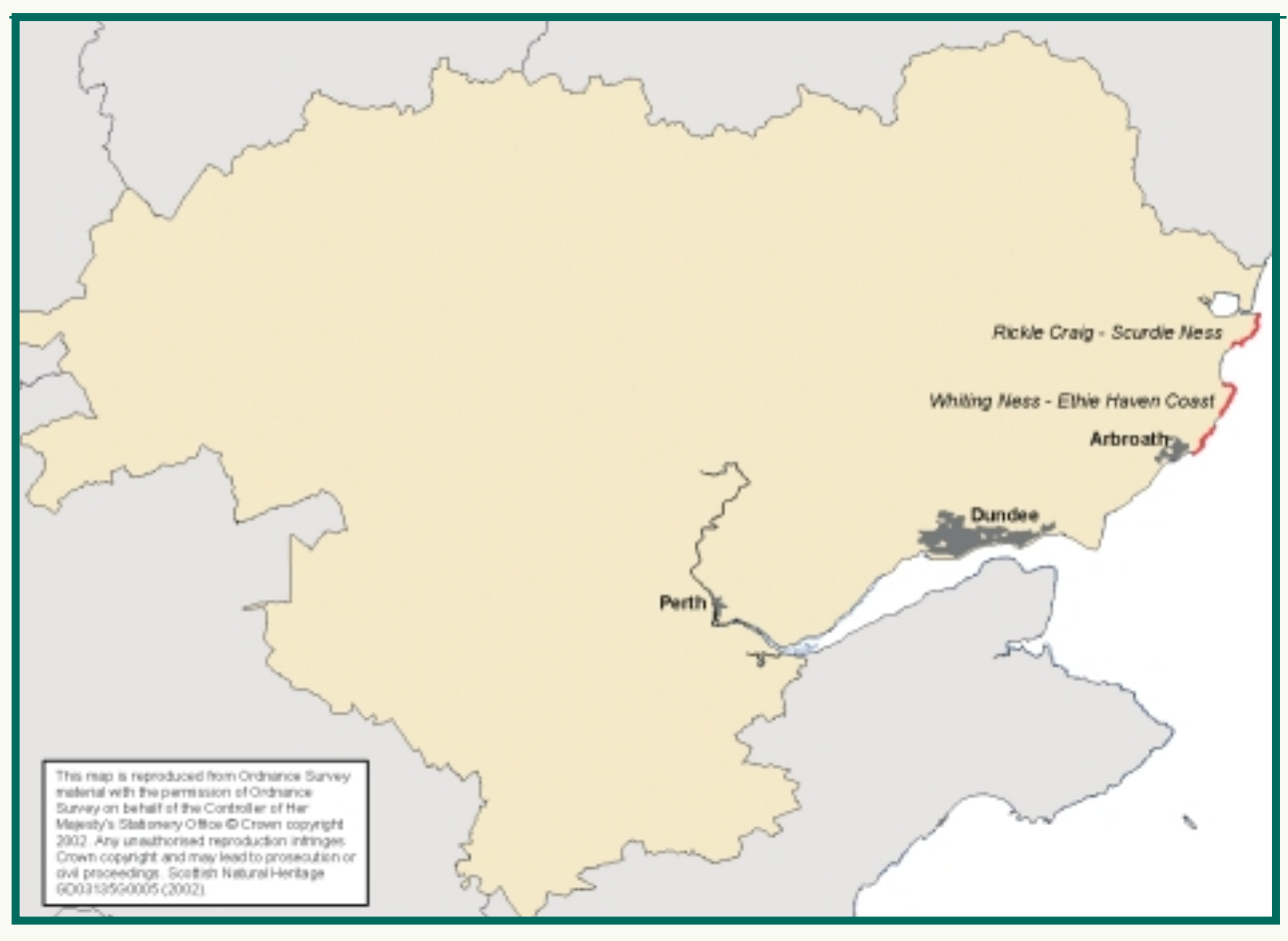
Tayside Biodiversity Partnership **** BIODIVERSITY

This illustrative map shows a few key examples of the habitat. Please note that many sites of interest are privately owned and owners' permission should be sought for any access.