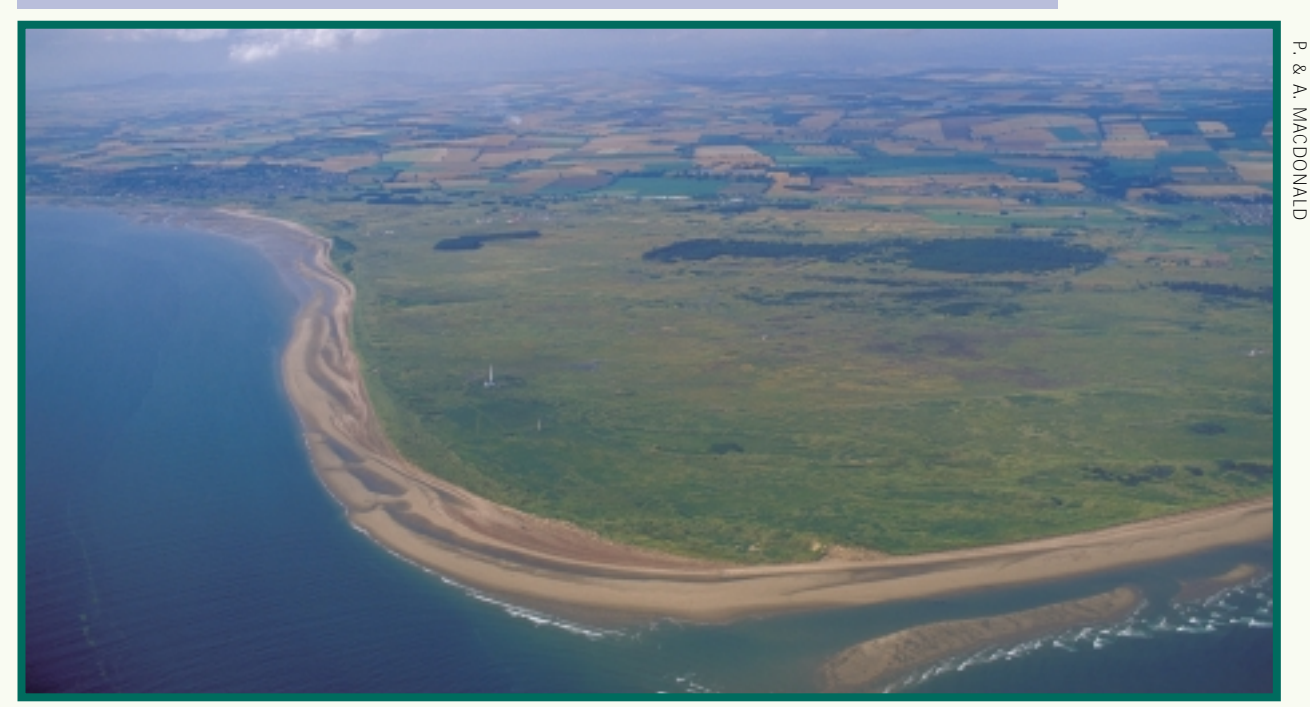
THE TAY ESTUARY AT BARRY BUDDON, ANGUS