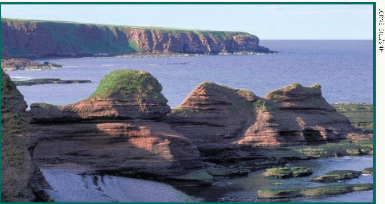
SEATON CLIFFS, ANGUS