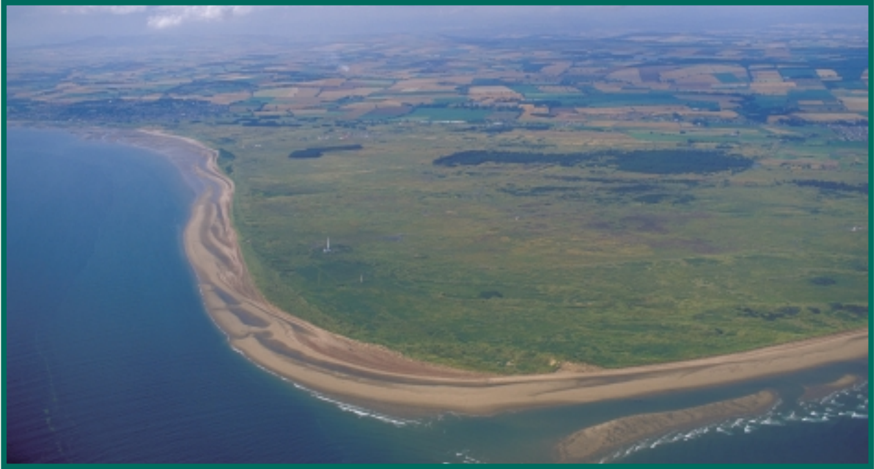
THE TAY ESTUARY AT BARRY BUDDON, ANGUS