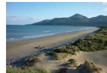
Shannagh-More Outdoor Education Centre

"We worked with National Park Rangers to remove cow parsley from upland hay meadows. It competes with less tall plants and has the ability to spread rapidly changing the plant make-up of the meadow."