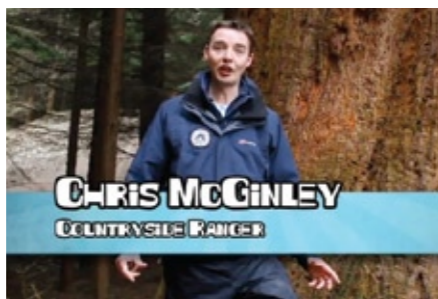
South Lanarkshire TV

"No matter how often you visit your wild place and think you know it, there is always something new to discover, almost as if I you're discovering it for a first time."