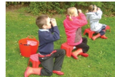
Burnfoot Community School