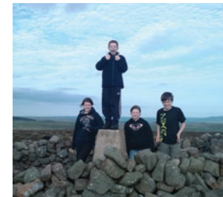
Rothbury and Coquetdale Youth Project

1,000s of young people discover wildlife through adventurous activities and put in over 9,000 hours of conservation volunteering. Click on the image for a 3 minute film, click on text for the Conserve Audit.