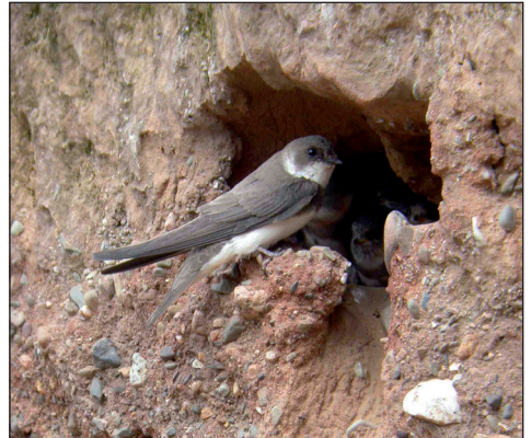
Sand Martin - a difficult season in 2007 for the birds, and their ringers!

rides flooded out. We hope that the better start to the 2008 breeding season will have put all RAS ringers back into top gear and that the birds themselves will start to recover from last year's low productivity.