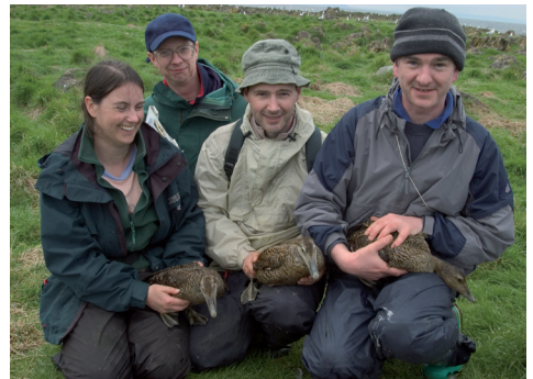
Not every capture is successful!