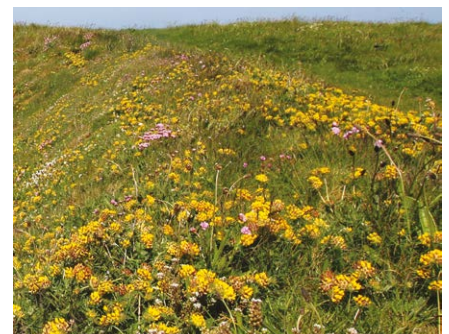
Below Coastal Kidney Vetch rich grassland

The Small Blue relies on grassland habitats that provide shelter for the adults and early successional conditions where Kidney Vetch can flourish. In Scotland most colonies are found on steep coastal grasslands and sand dunes but some colonies occur on man-made habitats including quarries, disused railway lines and tracksides. Some of the inland colonies in the Cairngorms are found on river shingles.